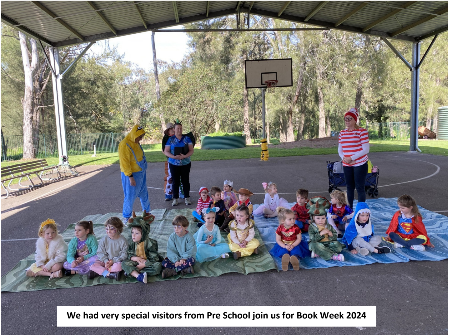
We had very special visitors from Pre School join us for Book Week 2024