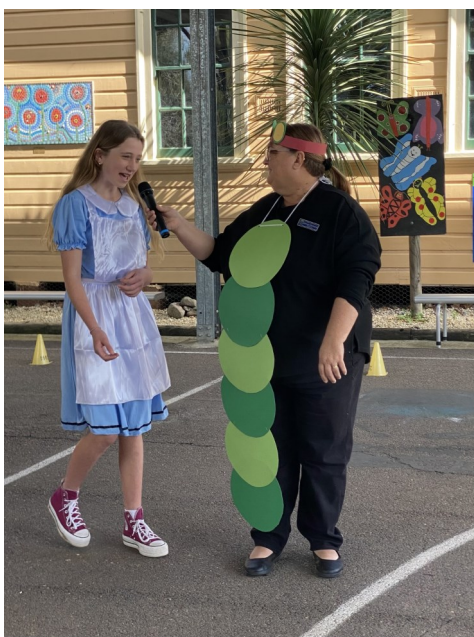
The Very Hungry Caterpillar asked us lots of questions????