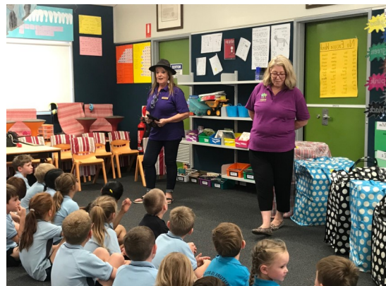
Hopkins Relieving Principal